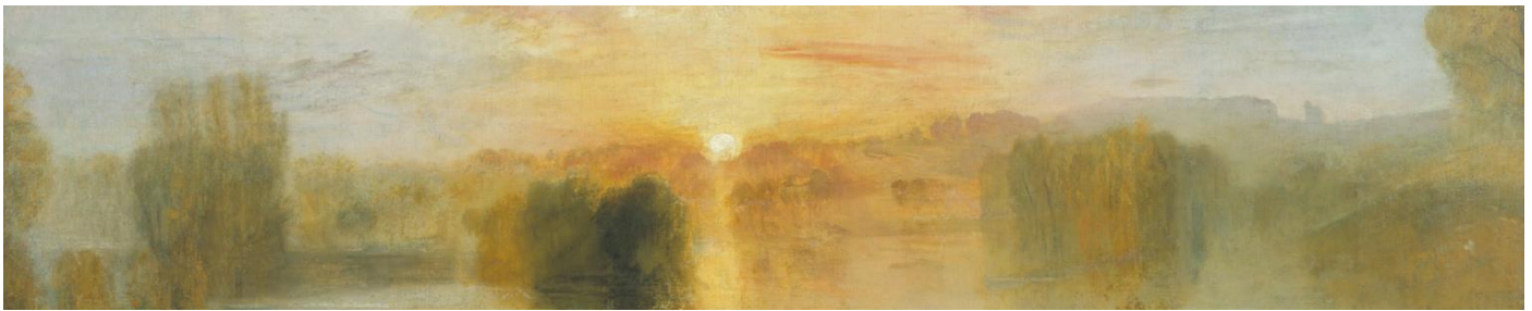
JMW Turner: The Lake, Petworth, Sunset, (detail), 1827 (Tate Gallery)

The Mighty One, God, the LORD, has spoken, and summoned the earth from the rising of the sun to its setting. Psalm 50:1