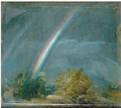
John Constable: Landscape with A Double Rainbow, 1821 (V&A)

In the Old Testament God spoke directly to man: I have set my rainbow in the clouds, and it will be the sign of the covenant between me and the earth. Genesis 9:13