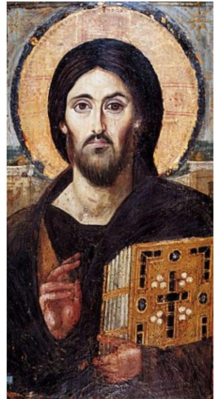
The oldest surviving icon of Christ Pantocrator, c. 6th century (Saint Catherine's Monastery, Mount Sinai)

And now God speaks to us in His Son, and in taking human form he is visible to us, as in the "embodied prayer" of the Byzantine icon.