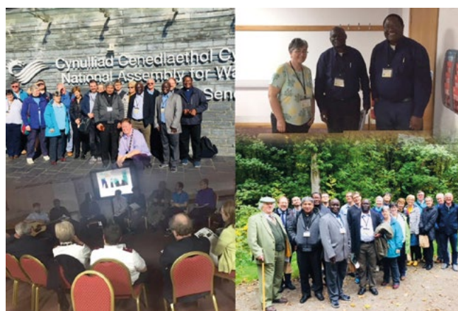
Photos from the October 2018 Welcome to Wales course.