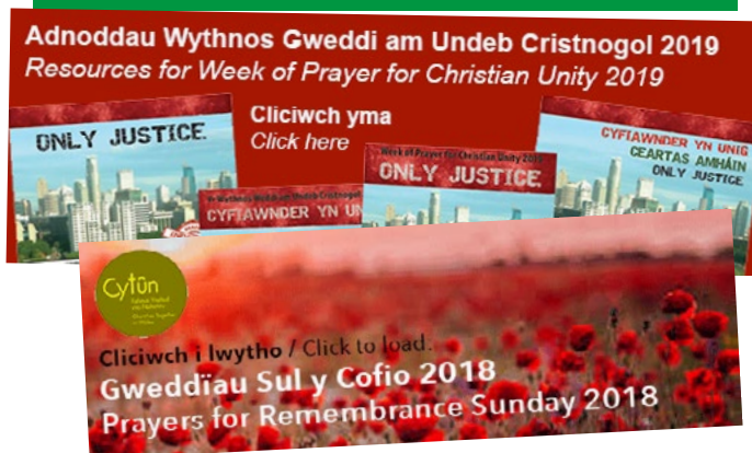
Examples of resources available on the Cytûn website

Cytûn staff members have produced bilingual prayers for Remembrance Sunday 2018 which also appear on CTBI's website, and can be easily adapted for any occasion of remembrance and commitment to peace.