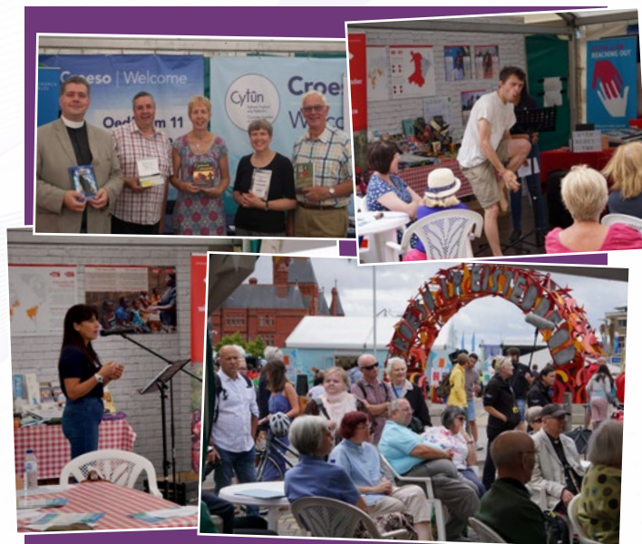
Photos from the Cytûn Tent at the National Eisteddfod